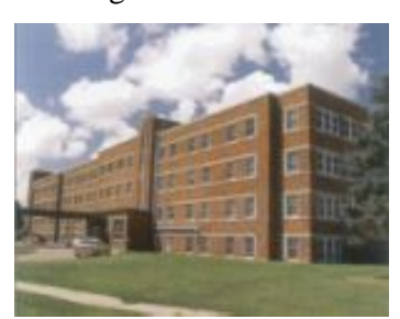
St. Elizabeth's Hospital of Humboldt, built in 1955.

tradition as St. Elizabeth's moves toward a future with expanded ambulatory care, emergency and diagnostic space. The new facility will house 34 acute in-patient beds (32 medical/surgical beds and two